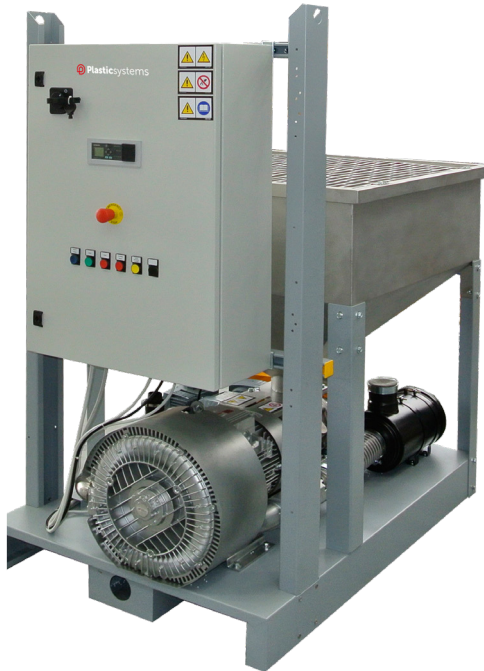
Thrust loading unit with tank

Thrust loading units are ideal for the pneumatic conveyance of material from a ground location to indoor and outdoor silos.