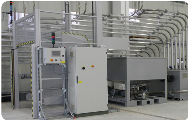
Thrust loading unit with Octabin station